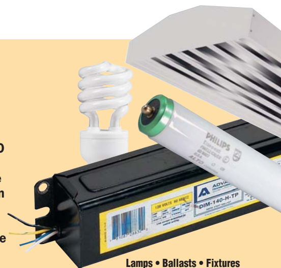
Lamps • Ballasts • Fixtures

For select products, WESCO can provide materials for trial installations. If you are not satisfied, you can return the product at no charge to you. Contact your local WESCO sales representative for more details.*